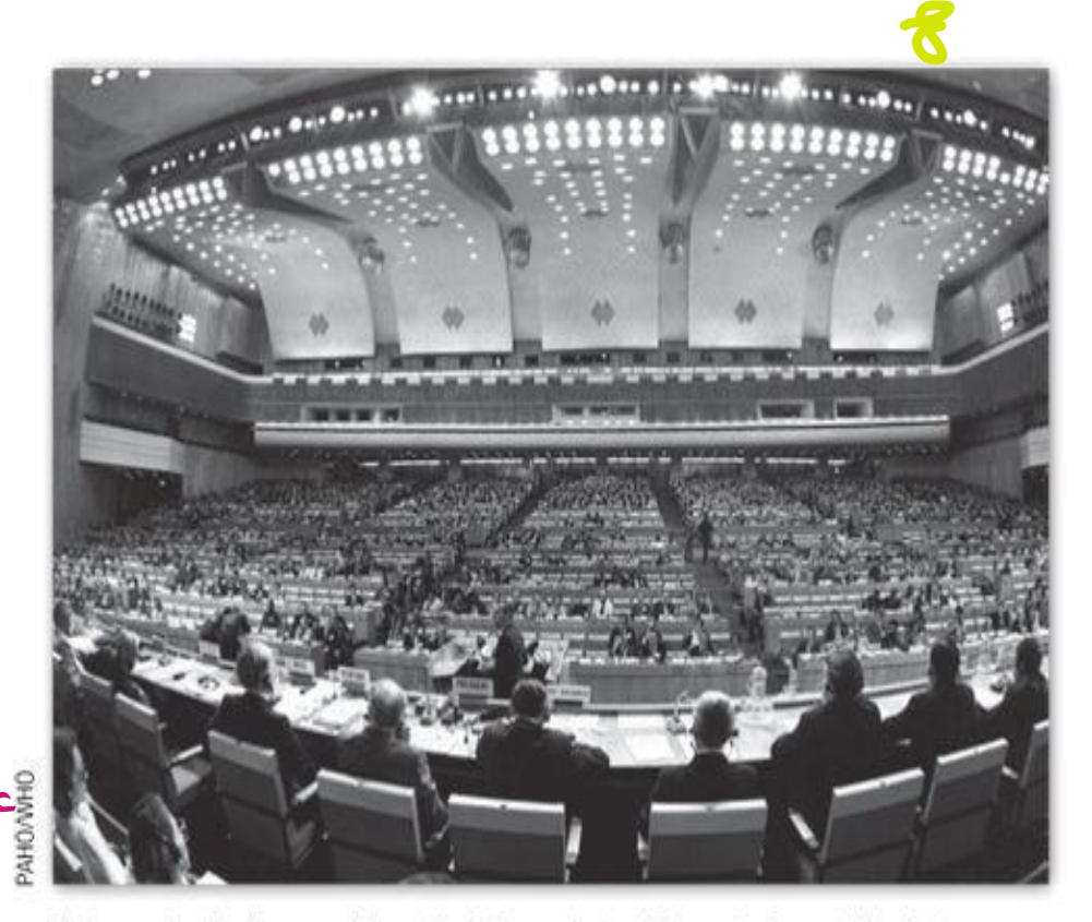
The International Conference on Primary Health Care at the Lenin Convention Center in Alma-Ata in September 1978.